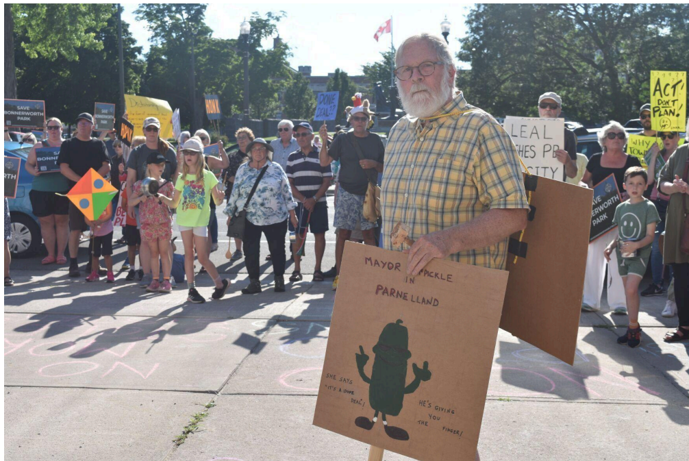
A large crowd gathered outside Peterborough City Hall in June, protesting the redevelopment of Bonnerworth Park.