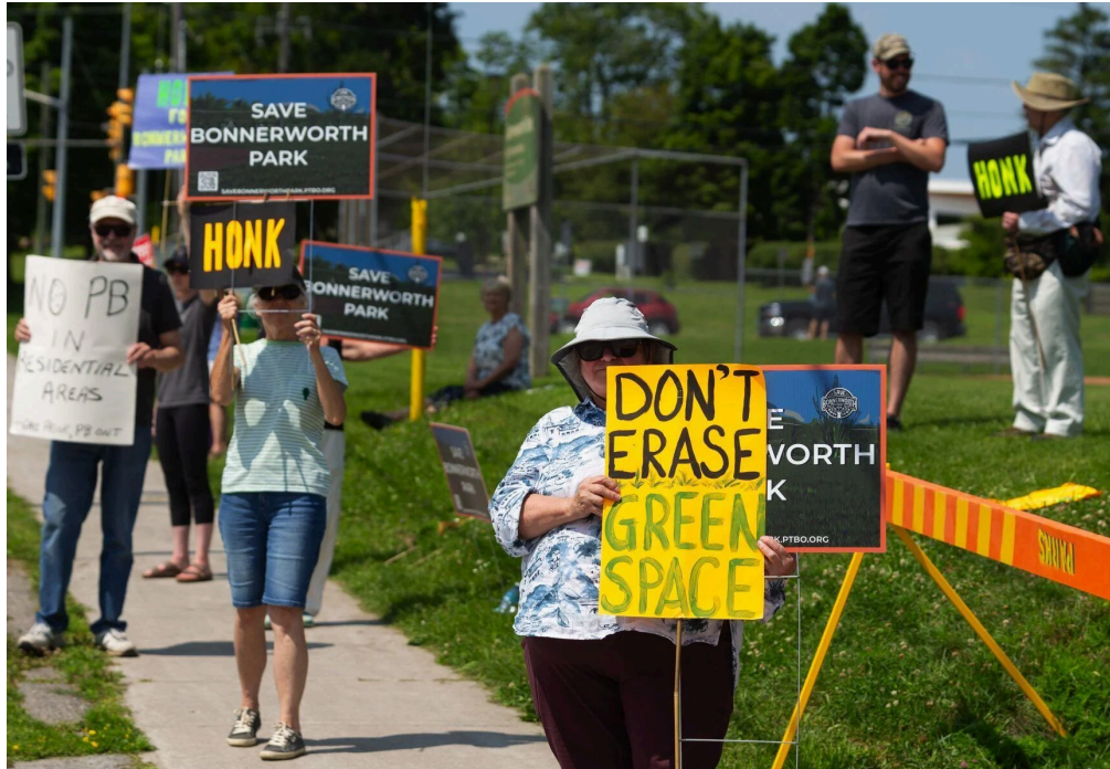
Protesters carry placards against the redevelopment of Bonnerworth Park that includes 16 new pickleball courts, during a recent pickleball tournament held at the park.