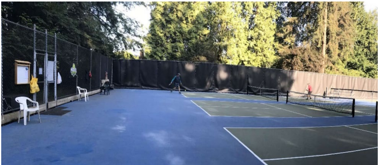
Figure 1: Pickleball courts surrounded by reflective noise barrier

Figure 1 shows an example of a sound reflective barrier material installed on the chain link fence at the Murdo Fraser pickleball courts in North Vancouver.